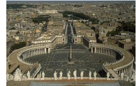
The Colonnade in the piazza in front of St. Peter's Basilica, Vatican, 1656-1667